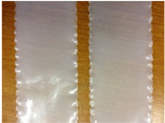
Adding eggshell nanoparticles to a bioplastic

Unlike other petroleum-based plastic polymers, PBAT begins to degrade within three months after