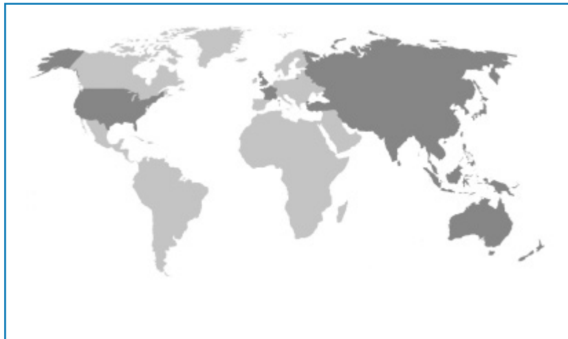
The shaded areas of the map indicate ESCAP members and associate members