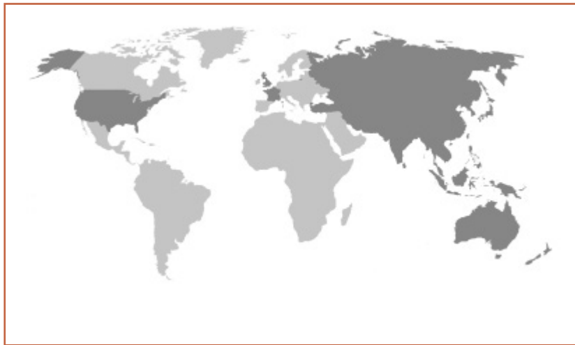
The shaded areas of the map indicate ESCAP members and associate members