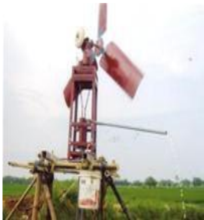
Wind power based water pump