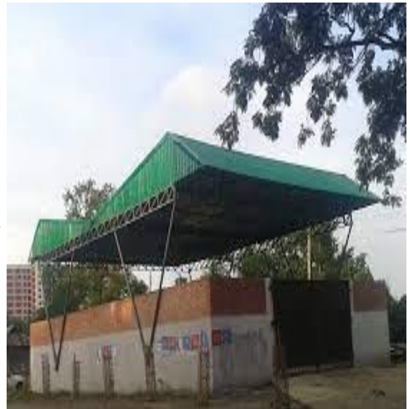
secondary transfer station