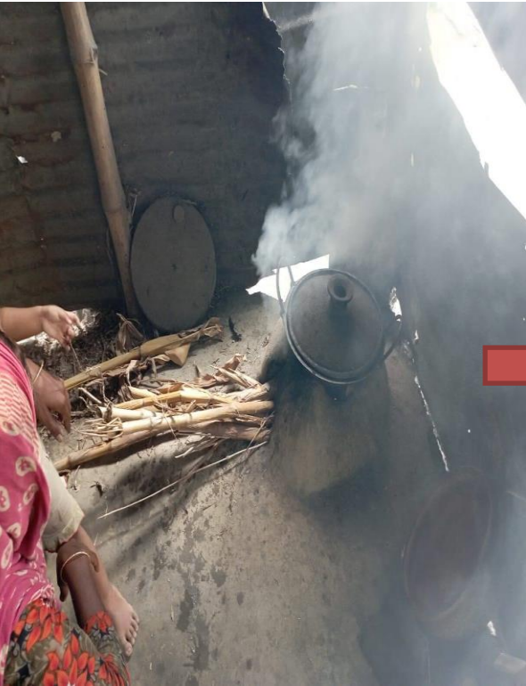
Traditional solid fuel cook stove