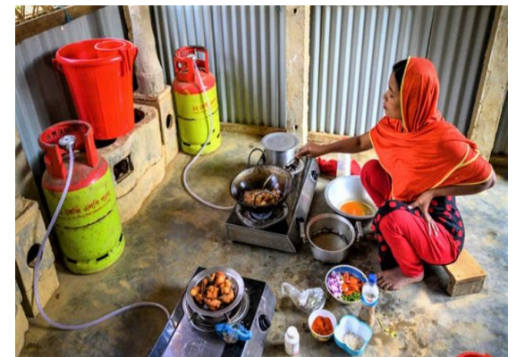
LPG Cook stove