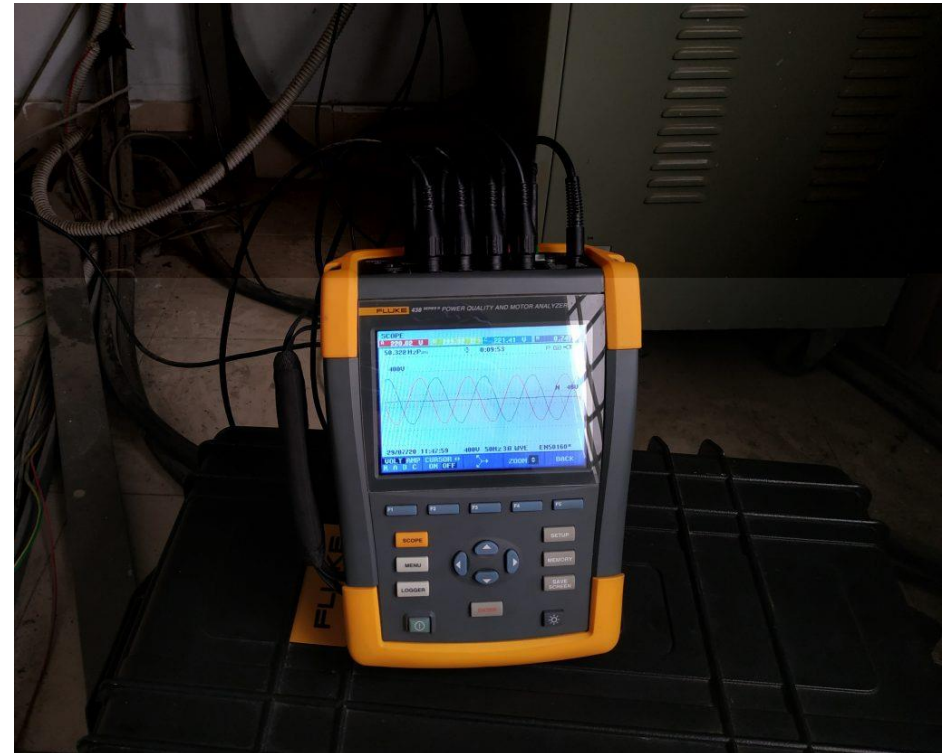
Energy efficient technology