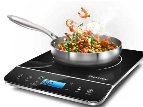
Electric cook stove