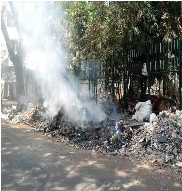
Open road side waste burning