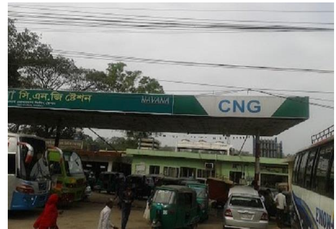
Ban Two-Stroke Three-Wheelers vehicle (200 1)